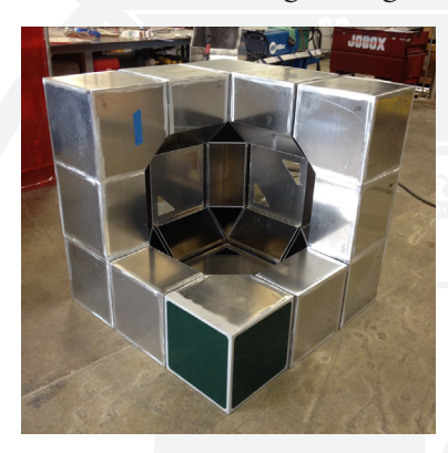
Each individual cube measures 15 inches per side, weighs about 14 pounds, and will have a painted finish.