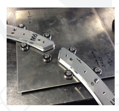
The final cube will have over 2000 individual parts!