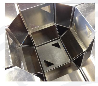
Made out of rolled aluminum, the structure is both rigid and light weight.

SATURDAY - FANFEST Ride on the Ferris Wheel at Saturday's FanFest at ECAV